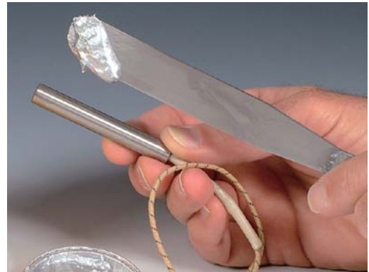
Heat-Away™ 639 coats process heater to improve thermal contact.