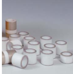
Pyro-Duct™ 597-C metallizes ceramic tubes.