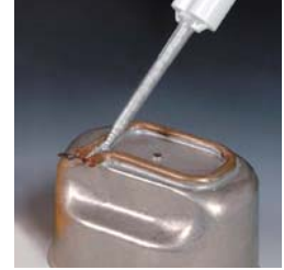
Aremco-Bond™ 568 bonds copper tube heater to reservoir.