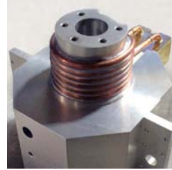
Aremco-Bond™ 568 bonds copper heat exchange tube to aluminum.